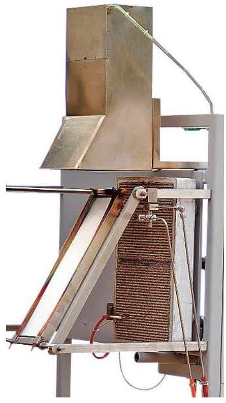
Radiant Panel, Specimen Holder and Exhaust Stack

Result processing is very simple by using the available curve fit feature. The temperature rise Vs time graph can be displayed and printed. The calibration data used for processing the results can be changed and recalculated after the test run. Report can be generated and printed by one push of a button on the Print Report Panel.