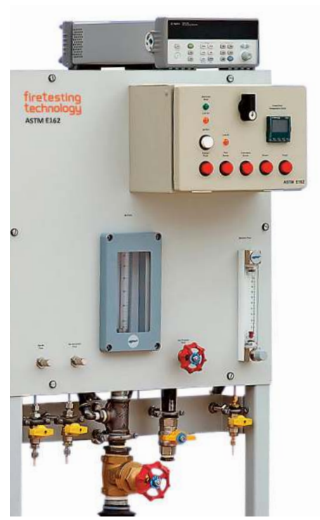
Gas Panel, Control Box and Data Logger