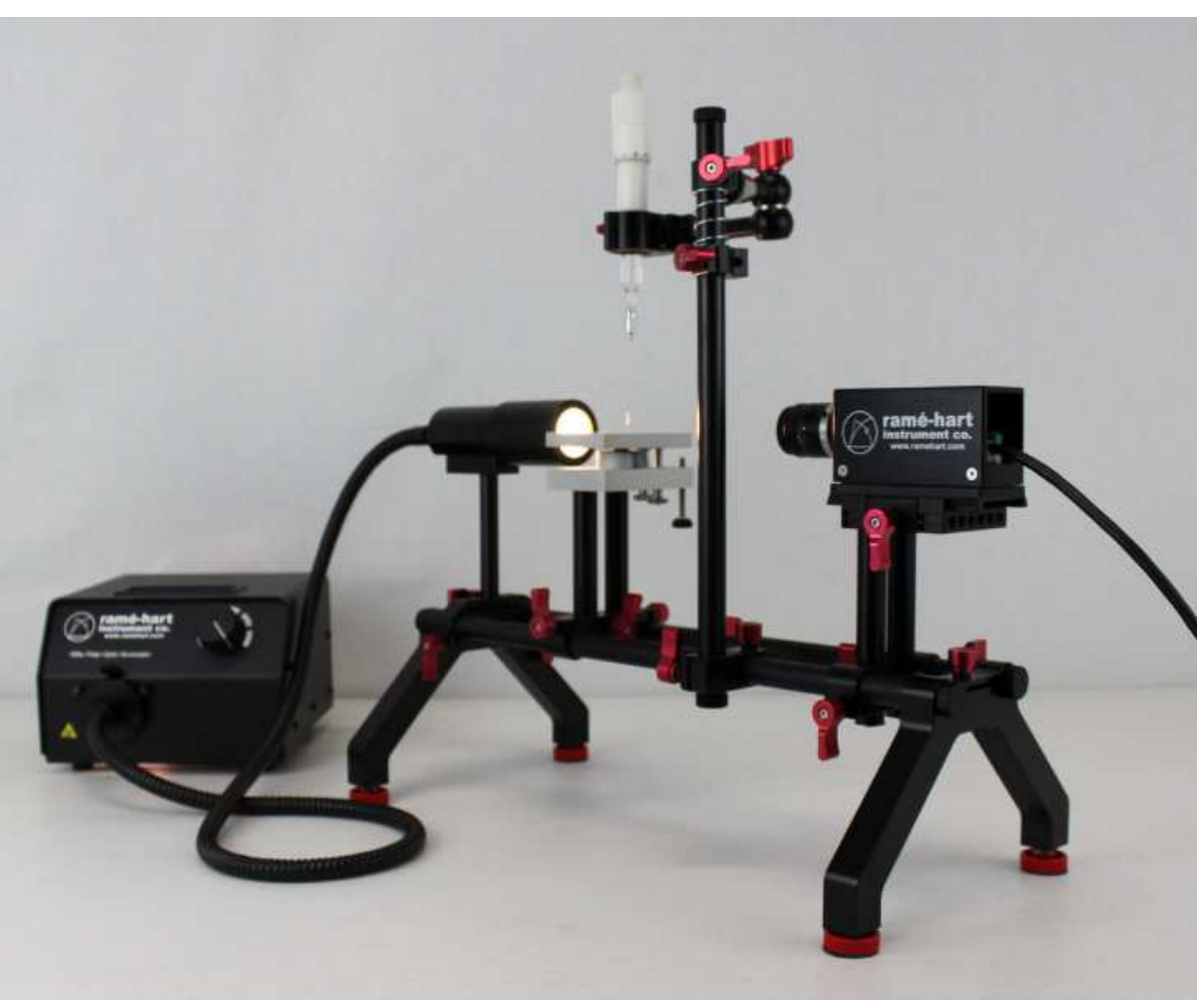
Model 90 shown with optional Fiber Optic Illuminator Upgrade