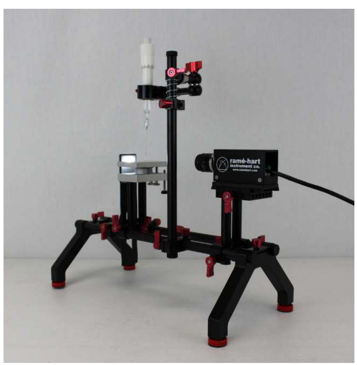
Model 90 Pro Edition Contact Angle Goniometer / Tensiometer