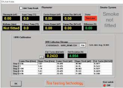
The software interfaces with the OSU apparatus via a data logger system, into which all the required signals are connected