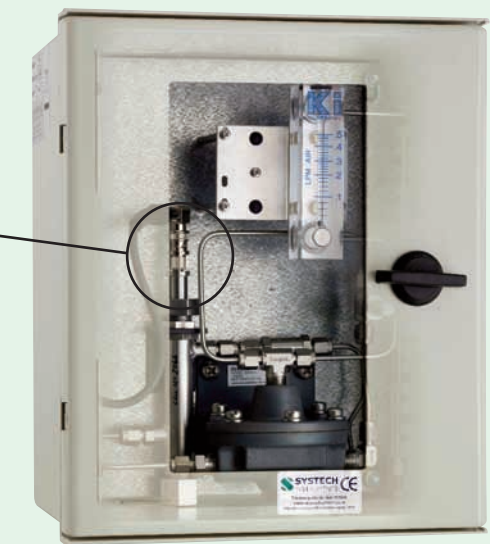
Remote sensor assembly (IP66/NEMA 4X)

The phosphorus pentoxide (P 2 O 5 ) moisture sensor consists of a dual platinum winding formed around a quartz tube about 8 cm long. The extremities of the windings are sealed by a resin coating, and the bare platinum electrodes coated with a thin film of P 2 O 5 . PTFE guides are provided at each end of the sensor through which the electrical connections to the windings protrude. A constant voltage is applied across the windings and the resultant current is monitored. As a flow of gas is passed over the sensor, the moisture in the gas stream is attracted to the P 2 O 5 coating, and the resistance of the platinum coil changes due to the electrolysis of the moisture into hydrogen and oxygen gases. This change in resistance creates a change in the measured current, that according to Faraday's Law is directly proportional to the amount of moisture in the gas stream. Therefore, a knowledge of the gas flow rate through the sensor and the current in the cell gives an absolute measure of the moisture contained in the sample gas.