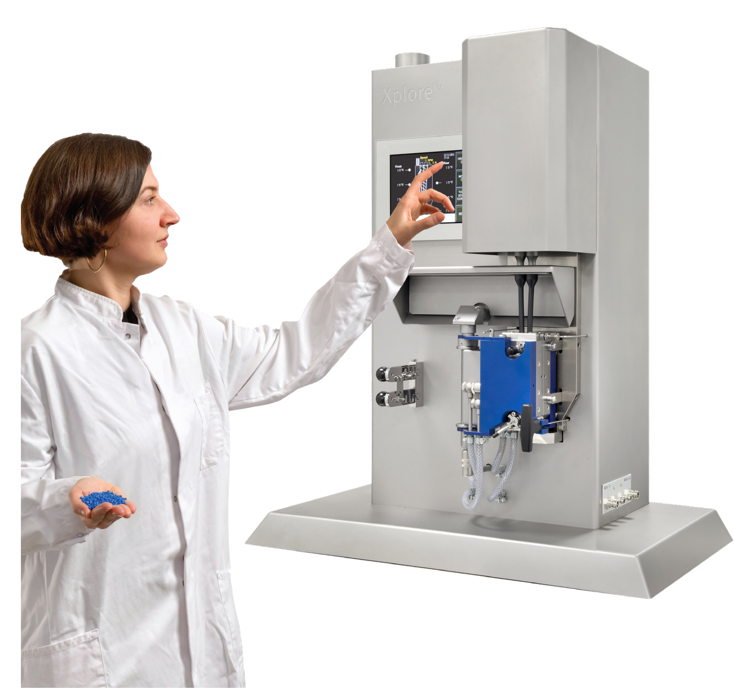
*) Xplore Instruments BV, proprietary technology

The core of this laboratory machine is formed by a divisible, fluid-tight barrel containing two detachable, conical, fully intermeshing mixing screws. These screws and the barrel are specially treated to minimise wear and to make them resistant against chemicals. Chemical resistance and hardness are essential to maintain their original geometries which enable to generate reproducible data over many years.