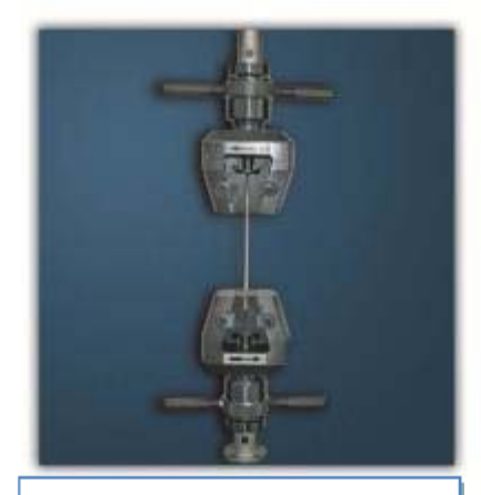
Wedge action tensile grip

Extensive range of accessories to meet test requirements in almost any application or industry: plastics, metals, biomedical, composites, elastomers, components, automotive, aerospace, textiles, and more.