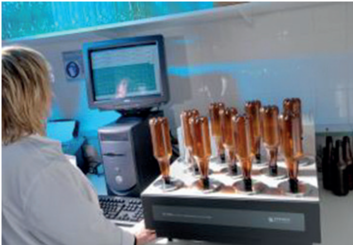
Test 11 chambers at once

One analyzer has the ability to evaluate a wide range of barrier alternatives and their corresponding performance.